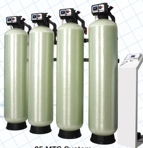
95 MTS System