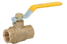
Female Water Supply 1/2" Threaded Ball Valve

OPTIONAL: If the drip tray is to be plumbed to waste the customer needs to supply a rigid vertical pipe that drains to a properly trapped drain according to local codes. The vertical pipe for the drip tray drain must be located directly behind where the machine is to be installed and must be at least 1 1/4" ID.